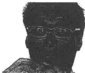
Info you need to Learn